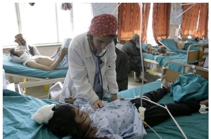
One of Afghan’s few woman doctors attends to a young girl injured in a bus crash in Kandahar.