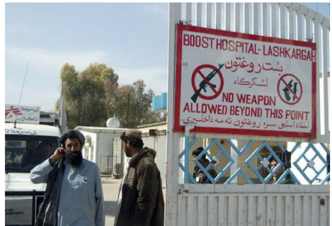
Men outside the Boost Hospital in Lashkar Gah guard the complex from potential attacks. Fighting is prevalent in the surrounding districts of Nad Ali, Marja, Geremshir, and Nawa.

hospitals surveyed were designated as acceptable.