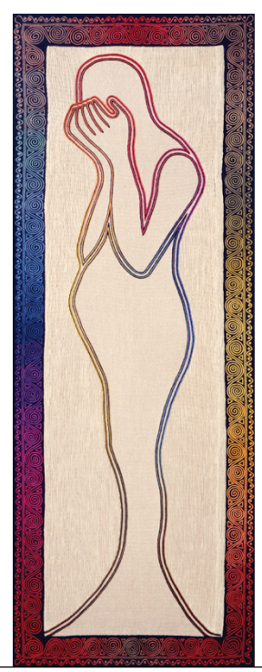
Figure 6: Judy Chicago, EU-53 Birth Figure 6: Smocked Figure, 1984, Smocking and Embroidery over Drawing (needleworker: Mary Ewanoski), Laminated Title Panel, One Laminated Text Panel, 156.2 x 55.9 cm, Salon 94, New York, New York

EU-53 Birth Figure 6: Smocked Figure (Figure 6) by Judy Chicago is a striking piece of artwork that demands attention. In the center of the 156.2 x 55.9 cm panel stands a female figure in <sup>3</sup>/<sub>4</sub> view. Made of smocking and embroidery over a drawing and laminated panel, the medium is what differentiates Chicago's work from other contemporary artists. The unnamed woman holds her head in her hands as if crying, and the curvature of her stomach indicates pregnancy. Her form is nothing but a simple rainbow outline, but the emptiness of the space inside and around her echoes her melancholy sentiments. The border of this 1984 work is a series of repeating geometric patterns created in rainbow material, juxtaposing the taupe fabric within. While the woman's body is created with continuing