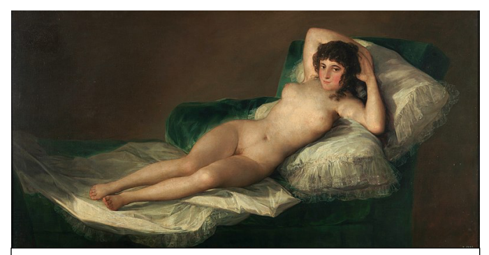
Figure 2: Francisco de Goya, La Maja Desnuda, 1800, Oil on canvas, 98 x 191 cm, Museo del Prado, Madrid, Spain

Again, her nudity and seductive pose are intended to elicit desire from the male viewer, rather than portraying her as a fully realized human being.