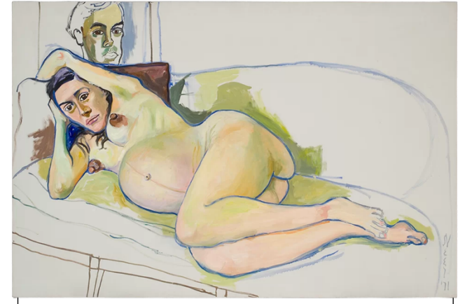
Figure 4: Alice Neel, The Pregnant Woman, 1971, Oil on Canvas, 101.2 x 152.4 cm, Estate of Alice Neel, New York

takes up most of the 101.2 x 152.4 cm canvas, with her body splayed on its side, and one arm draped suggestively over her head and the arm of her chair while the other supports her face. The woman's face is rendered in a detailed and expressive style, capturing her introspective and somewhat exhausted countenance that expresses the physical and emotional toll of pregnancy (Pregnant Woman, 1971). The woman's swollen belly and breasts are prominently portrayed in varying tones of pale greens