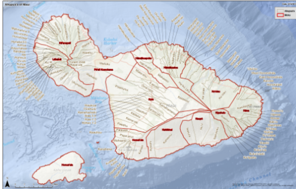
FIGURE 1: Maui AhupuaʻA Boundaries (Maui Nui AhupuaʻA Project, n.d).

foundation of indigenous and traditional land management as a productive and effective method for preserving, conserving, and maximizing land production necessitates a deeper understanding of the practices of the Hawaiian Islands and their storied culture.