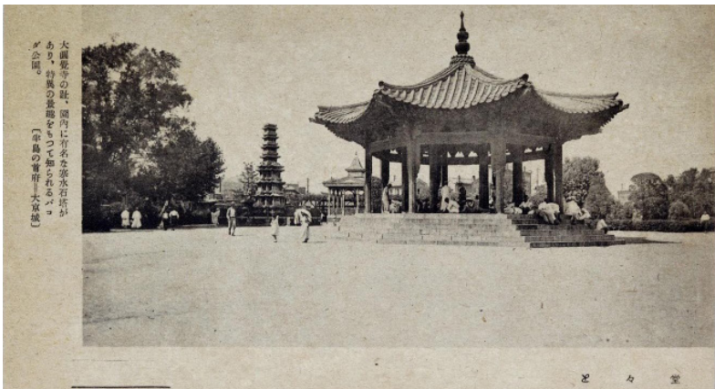
Figure 3) “Pagoda Park,” in Keijo series, 1925-1933.