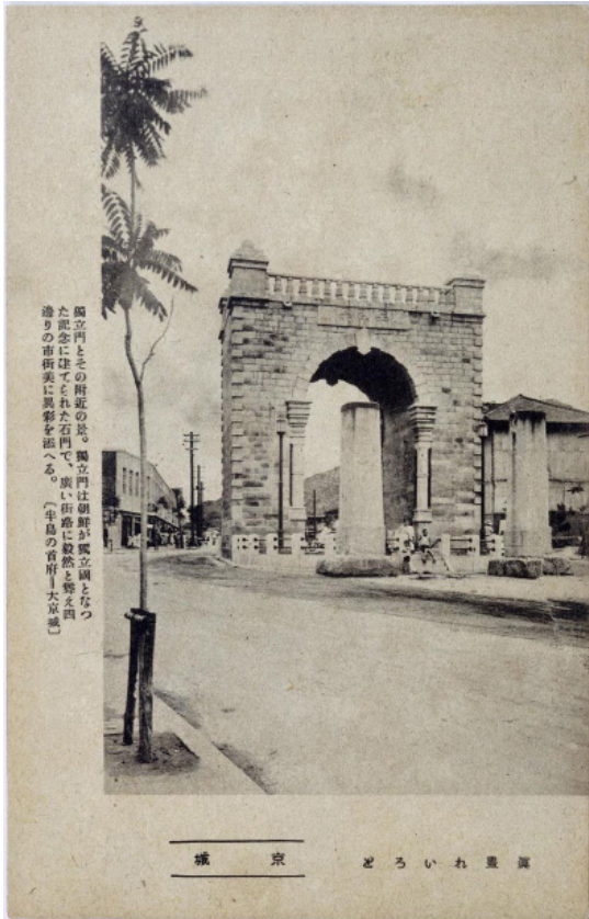
Figure 2) “Independence Gate,” in Keijo series, 1925-1933.