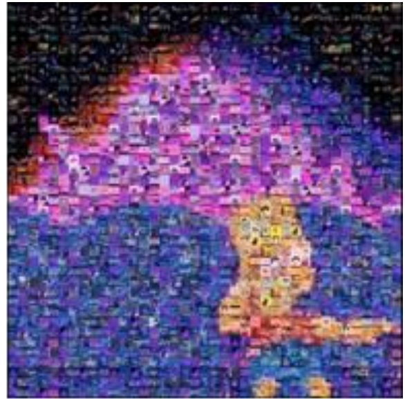
Figure 3. “lofi” and “chill beats” compilation on the left. “lofi,” “jazzhop,” and other less-related genres included on the right.

Even though lofi hip-hop is a sonic medium, the album/compilation photos and visuals associated with the genre provide additional insight into the atmosphere that lofi invokes. Upon first glance, many lofi streams use distinctive colors with common themes. In order to better visualize the common colors shared between lofi songs, compilations, and streams, I created a photo mosaic. This method allowed me