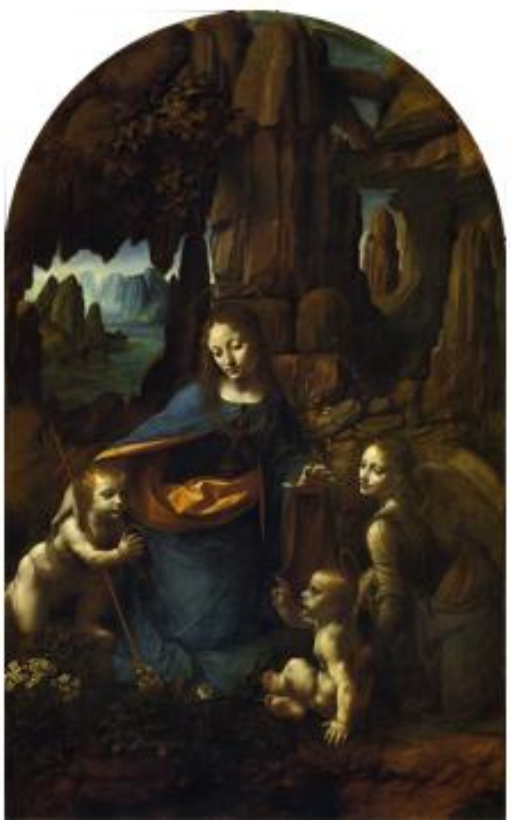
FIGURE 2. Leonardo da Vinci's two versions of Virgin of the Rocks . The work on the left was painted from 1483 to 1486 and is currently housed in the Musee du Louvre, Paris. The work on the right was painted from 1495 to 1508 and is currently housed in the National Gallery, London.

The Last Supper is da Vinci's capolavoro, or masterpiece, in its meticulous exploration of light and optics and the careful rendering of the figures casting shadows upon one another. Da Vinci not only attended to the refraction and reflection of light, but also considered the imperfections inherent in optical perception of the piece. The Last Supper (Figure 3) "embodies Leonardo's longstanding preoccupation with the science of optics and acoustics...portraying...the outward movement" (Marani, 2003, p. 298). Described as "the summa" and the "climax of Leonardo's career as a painter," da Vinci's masterpiece brings forth a particularly inspired luminosity (Marani, 2003, p. 299; Clark, 1988, p. 144).