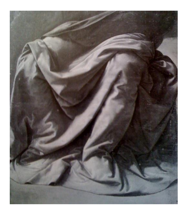
FIGURE 1. Leonardo da Vinci's drapery study shows his dexterity with chiaroscuro, the use of lightness and darkness to give depth and physicality to a piece. The study is housed in the Musee du Louvre, Paris (Marani, 2003, p. 16).

The shift from an emphasis on pure objectivity to the intangible nuances of color and light can be seen in his two depictions of The Virgin of the Rocks (Figure 2). His later rendition of the subject, painted in the 1490s, "demonstrates an evolution in Leonardo's painting that is reflected in his theoretical writings" (Marani, 2003, p. 140). In the progression of his work, "more and more attention is paid to the evocation of the impression of light upon objects and less to the linear description of their actual form" (Kemp, 2006, p. 37).